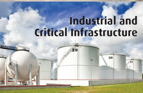
Industrial and Critical Infrastructure