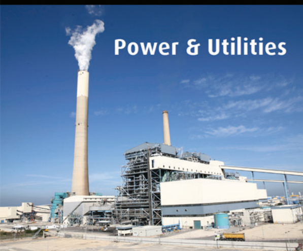
Power & Utilities